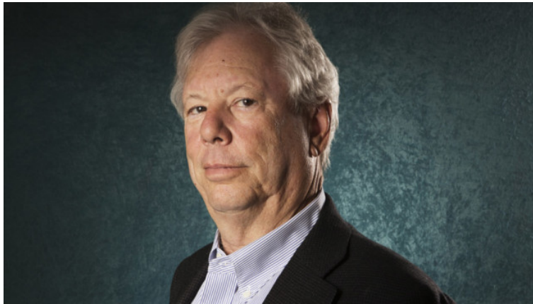
«Overconfidence is probably the biggest trap to fall into.»

Richard Thaler, leading behavioral economist and Nobel Prize winner, explains why investors often act irrational and why he would be a bit cautious with investments in the stock market.